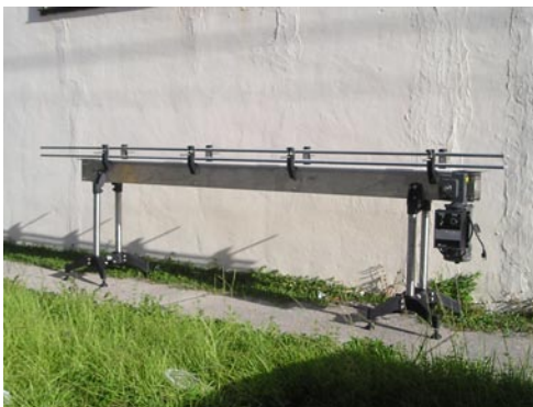
Custom standard 12 ft conveyor.