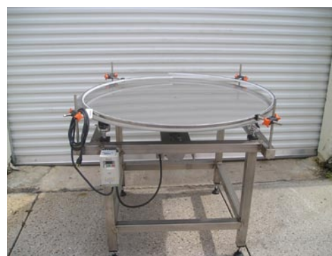
Custom 48" accumulating table.