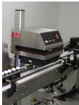
Enercon induction sealer on portable base.