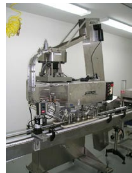
Surekap automatic capper with cap feeder.