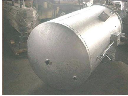
TWO BASKET RETORT